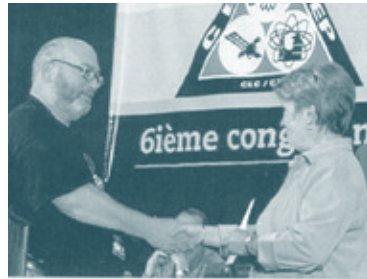
CEP delegate presentations